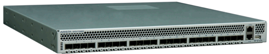
Arista 7124SX: 24-port 10GbE 480Gbps switch

The Arista 7124SX switch is a high performance, ultra-low latency layer 2/3/4 10 Gigabit Ethernet switch. Offered with 24 1/10GbE ports in a compact and power efficient 1RU chassis, the Arista 7124SX forwards packets in less than 500 nanoseconds. All ports accommodate the full range of 10GbE SFP+ and GbE SFP options, allowing for maximum flexibility and investment protection as customers of all sizes migrate their server connections from Gigabit to 10 Gigabit Ethernet. With Arista EOS, advanced monitoring and provisioning capabilities such as Latency Analyzer, Zero Touch Provisioning, VMTracer and Linux based tools can be run natively on the switch. A built in SSD is available for advanced logging, data captures and various services that can now be run from the switch.